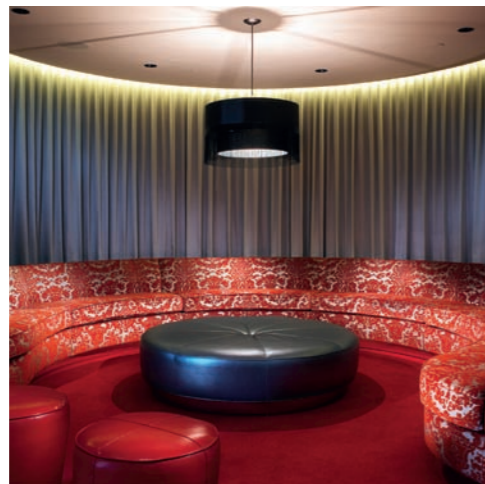
PREVIOUS PAGES View from the Hollywood Terrace ABOVE The lobby features a curved red-carpeted white marble staircase FAR LEFT Guestrooms are inspired by 1950s and '60s Hollywood films LEFT The luxurious pre-function seating area

nightlife. The outdoor bar on the ground floor, 'Station Hollywood', activates the metro plaza that links to this mass-transit hub.